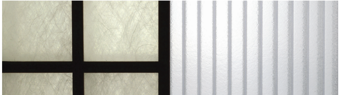
Fiberglass sandwich panel photographed side-by-side with a Wasco 40mm multiwall polycarbonate panel.