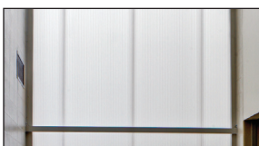
Wasco's V-Series LumiWall 40mm Multiwall Polycarbonate System