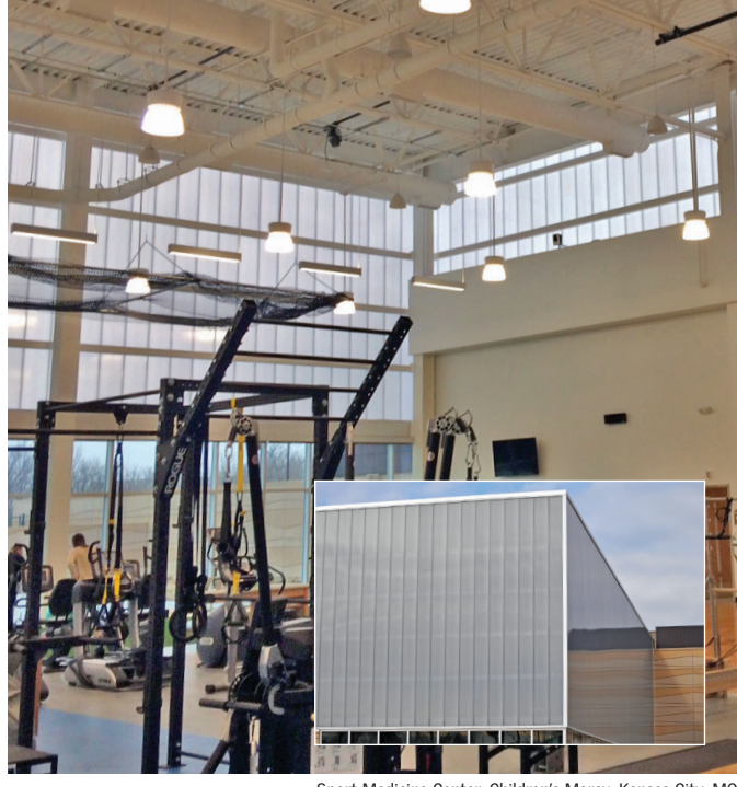
Sport Medicine Center, Children's Mercy, Kansas City, MO