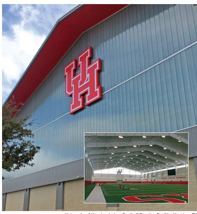
University of Houston Indoor Football Practice Facility, Houston, TX