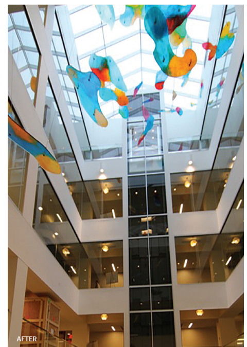
Before: Atrium with dark, dingy skylights which blocked light for years. After: Showing the space bathed in natural light with suspended glass sculpture.