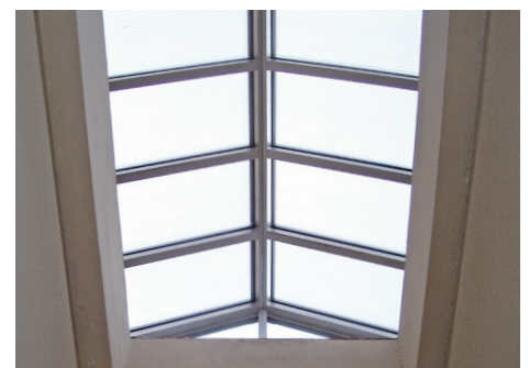
One of the two smaller skylights over the Elks Lodge.